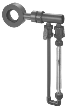
Figure 1 Mecon Orifice Flow Meter TM N4